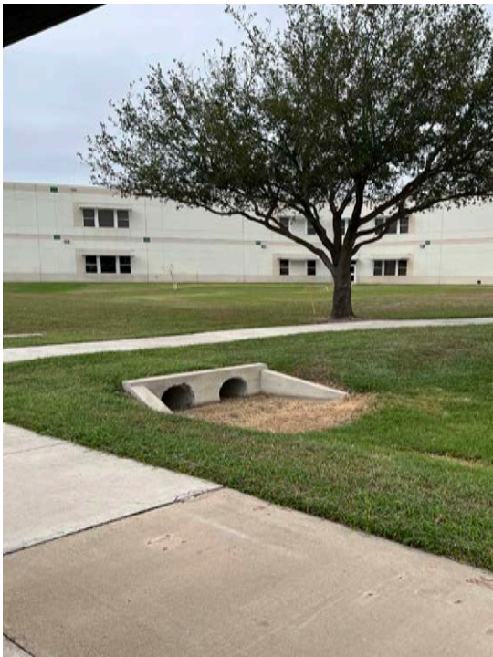
Here is what the site looks like from the bus station near South shary Road.