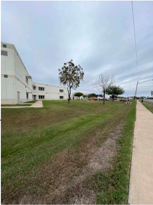
This is what the site looks like from where the sign to the campus is.