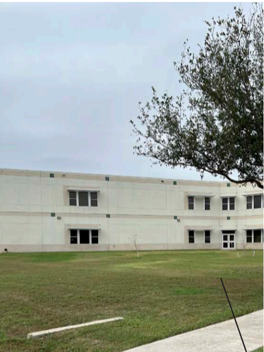
In this photograph, we would be walking across the top of the parking lot near South Shary Road. There would be pathway that lead into the amphitheater/lecture hall of the monument.