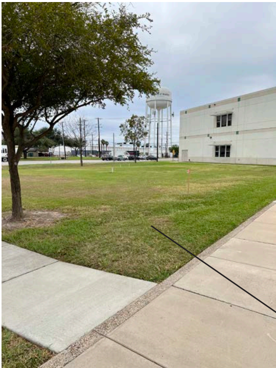
In this photograph, We are looking at the site from the corner of this pathway. Once the monument is built, it will be pretty hard to miss.