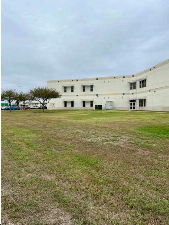
Here's what the site would look like from the sidewalk near South Shary Road.